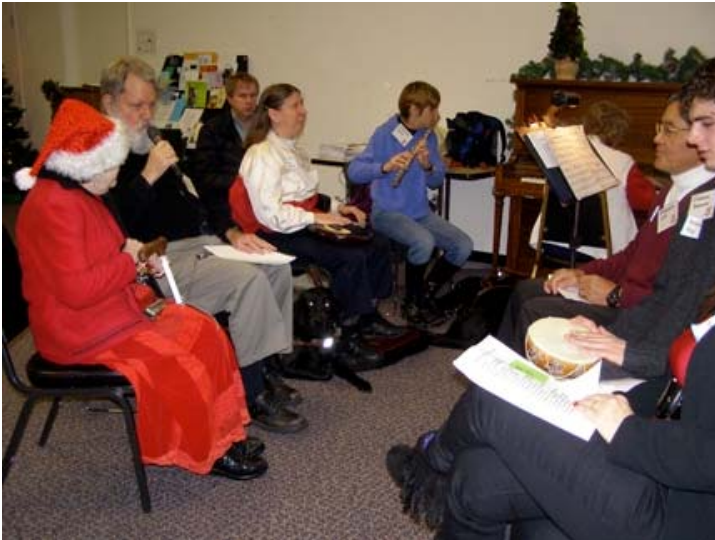
The Jingleers... guests at the Silicon Valley / DG Holiday Party gather to make merry with music.